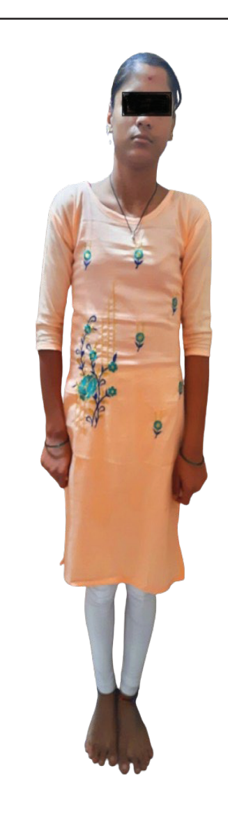
Figure 1. 17-year-old girl with primary amenorrhea suggestive of Swyer syndrome.

Swyer syndrome affects individuals with XY chromosomal make-up; nevertheless, they have a female appearance. The exact incidence is unknown. The diagnosis of Swyer syndrome is made based on thorough clinical evaluation, detailed patient history, identification of characteristic findings (e.g., amenorrhea and streaky gonads), and a variety of tests including karyotyping and FISH. Accurately differentiating Swyer syndrome (46, XY complete gonadal dysgenesis) from other disorders of sexual development is critical due to distinct implications for management, prognosis, and patient counseling. Several conditions, such as Turner syndrome (45X or mosaic variants), mixed gonadal dysgenesis (45X/46XY), and androgen insensitivity syndrome, can present with overlapping features but require additional investigations. The height