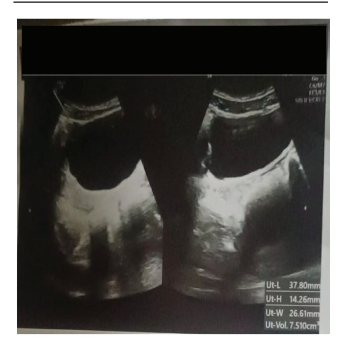
Figure 2. Ultrasound image showing rudimentary uterus.

This female approached us at the appropriate age and time. This helped us with the proper workup and management. A study by Michala et al. [3] also shows that many females experienced delays in reaching accurate diagnosis, often several years after the presentation to their general practitioners. It is suggested that health professionals should update their scientific knowledge and be aware of sexual development disorders. Early diagnosis