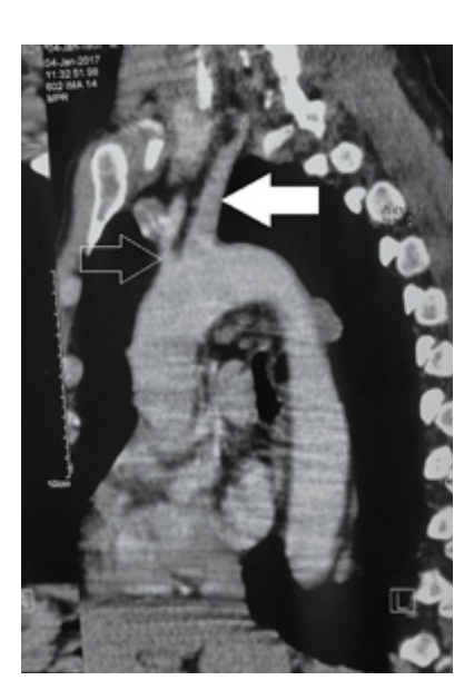
Figure 4: CECT Chest 3D sagittal reformat image. Both common carotids are seen originating from the arch of the aorta (white arrow). Left common carotid is the first branch in order of the origin.