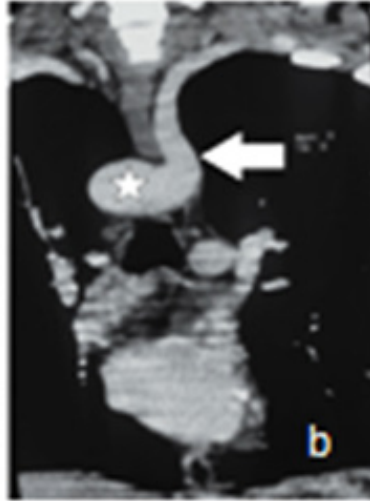
Figure 5: Aberrant left subclavian artery (ALSA). (a) axial section shows the course of ALSA at upper part of the chest. (b) coronal reformat image shows aneurysmal origin (white star) with upward deviation to the left upper extremity.