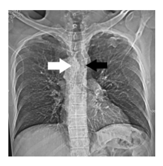
Figure 1: Plain X-ray chest PA view. The aortic knuckle is seen on right side (white arrow) and there is tracheal indentation over trachea at the same level (black arrow). Rest of the mediastinal structures are at normal sites.

The patient was placed on symptomatic treatment as no further management was warranted in this case.